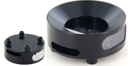
CD121P | Lanyard Metal Puck with Posts Integrated 4 hole connector For traditional lamination