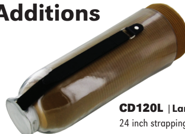
CD120L | Lanyard & low profile screw kit 24 inch strapping, (puck not included)