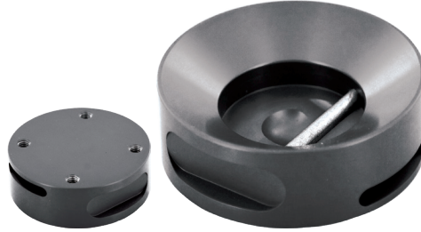
CD121 | Lanyard Metal Puck Integrated 4 hole connector For 3D printing