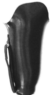
Ready for Laminating or Thermoforming No internal offset alignment

Adjust anatomically with the limb through offset alignment capability and can be adjusted vargus, valgus, extension, or flexion.