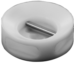
CD120 | Lanyard Plastic Puck For offset alignment