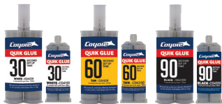
Quik Glue For custom Offset Offset up to .6"

Adjust anatomically with the limb through offset alignment capability and can be adjusted vargus, valgus, extension, or flexion.