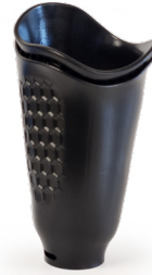
Ready for 3D Printing No internal offset alignment