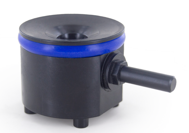
C<sub>10</sub>A Air-Lock Drop-In

Designed to be used as a drop-in in 3D printed sockets or in traditional fabrication methods with the fabrication dummy.