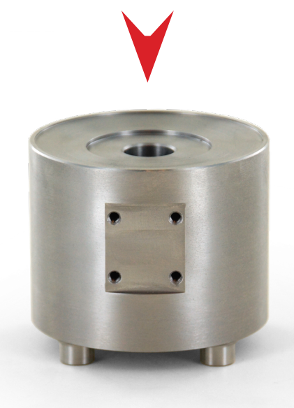
CD122EFD Easy-Off Drop-In Fabrication Dummy

Designed to be used as a drop-in in 3D printed sockets or in traditional fabrication methods with the fabrication dummy.