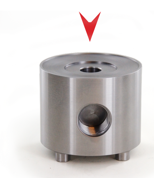
C<sub>10</sub>AD Air-Lock Drop-In Fabrication Dummy

Designed to be used as a drop-in in 3D printed sockets or in traditional fabrication methods with the fabrication dummy.