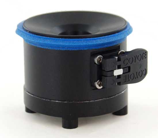
CD122E Easy-Off Lock Drop-In

Designed to be used as a drop-in in 3D printed sockets or in traditional fabrication methods with the fabrication dummy.