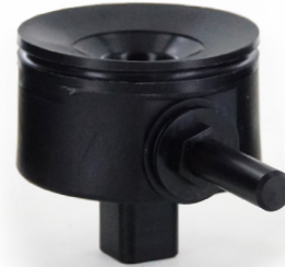
CD103D | Deep Air-Lock When long pin is needed