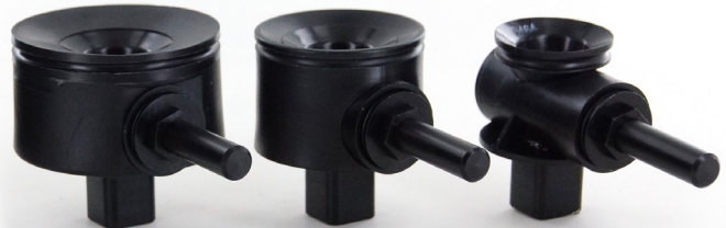
CD103D Deep Air-Lock