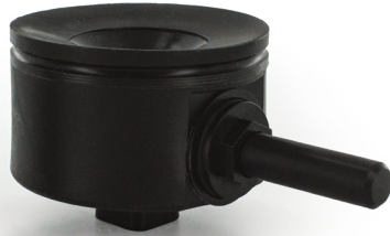
CD103 | Air-Lock