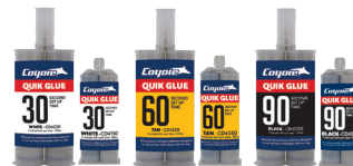
Quik Glue For custom Offset Offset up to .6"

Adjust anatomically with the limb through offset alignment capability and can be adjusted vargus, valgus, extension, or flexion.