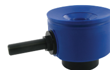
CD103FL Fitting Lock Air-Lock housing with reinforced distal end for accurate evaluation of lock pin spacing to improve seating of pin in lock.