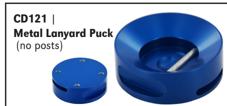
CD121 | Metal Lanyard Puck (no posts)