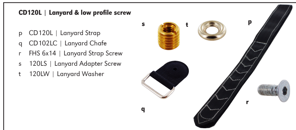
CD120L | Lanyard & low profile screw