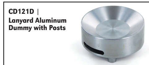
CD121D | Lanyard Aluminum Dummy with Posts