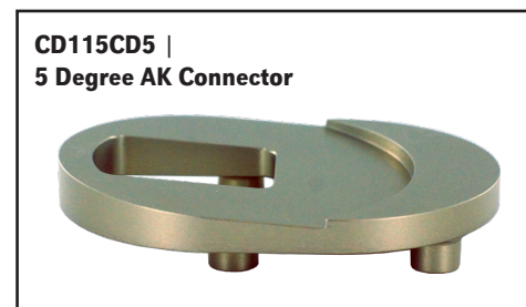
CD115CD5 | 5 Degree AK Connector

Detach here - keep everything below with patient records ✂ - - - -