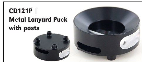
CD121P | Metal Lanyard Puck with posts