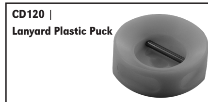
CD120 | Lanyard Plastic Puck